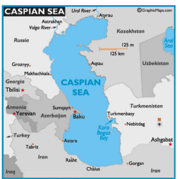
Figure 1: The Caspian Sea and its hydrogeology

The Caspian (Azerbaijani: Xəzər dənizi , Persian: دریای مازندران го دریای خزر от دریای این каспийское море, Kazakh: Каспий теңізі, Turkmen: Hazar deňzi) is the world's largest enclosed or landlocked body of (salty) water – approximately of the size of Germany and the Netherlands combined. Geographical literature refers to this water plateau as the sea, or world's largest lake that covers an area of 386,400 km² (a total length of 1,200 km from north to south, and a width ranging from a minimum of 196 km to a maximum of 435 km), with the mean depth of about 170 meters (maximum southern depth is at 1025 m). At present, the Caspian water line is some 28 meters below sea level (median measure of the first decade of 21st century)¹. The total Caspian coastline measures to nearly 7,000 km, being shared by five riparian (or littoral) states.