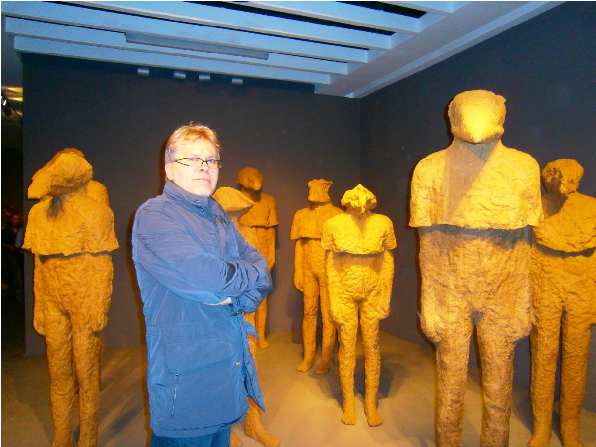
Author is professor in international law and global political studies, based in Vienna, Austria. His 7 th book From WWI to www. 1918-2018 is published by the New York's Addleton Academic Publishers last winter.