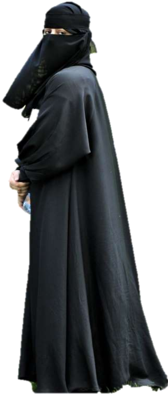
Figure 5. Hijab Style Niqab, Lady at Gulhane Park in Istanbul, Turkey; Mohannad Khatib, “Although the Niqab is not a required in Islam, many women opt to wear it. With the red tulips and the relaxing couple in the background, the Niqab Lady at Gulhane Park presented an interesting candid portrait.”