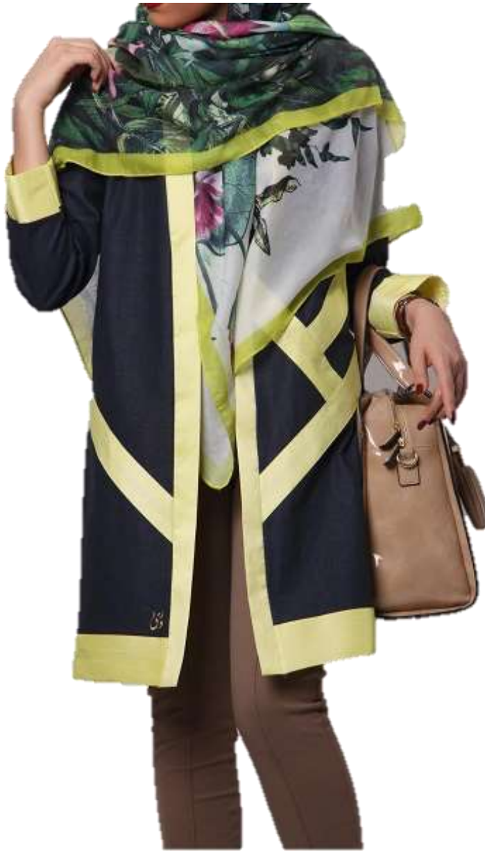
Figure 3. Hijab Style Chador, Street fashion for hijab Iranian styles; Humans of Iran, “Iranian women have had their special way of wearing from the time that Islam was introduced to Iran. Nowadays they are trying to create an identity and maintain an Iranian style of hijab fashion, pretty much similar to many other Muslim countries. But what is an Iranian hijab style,”