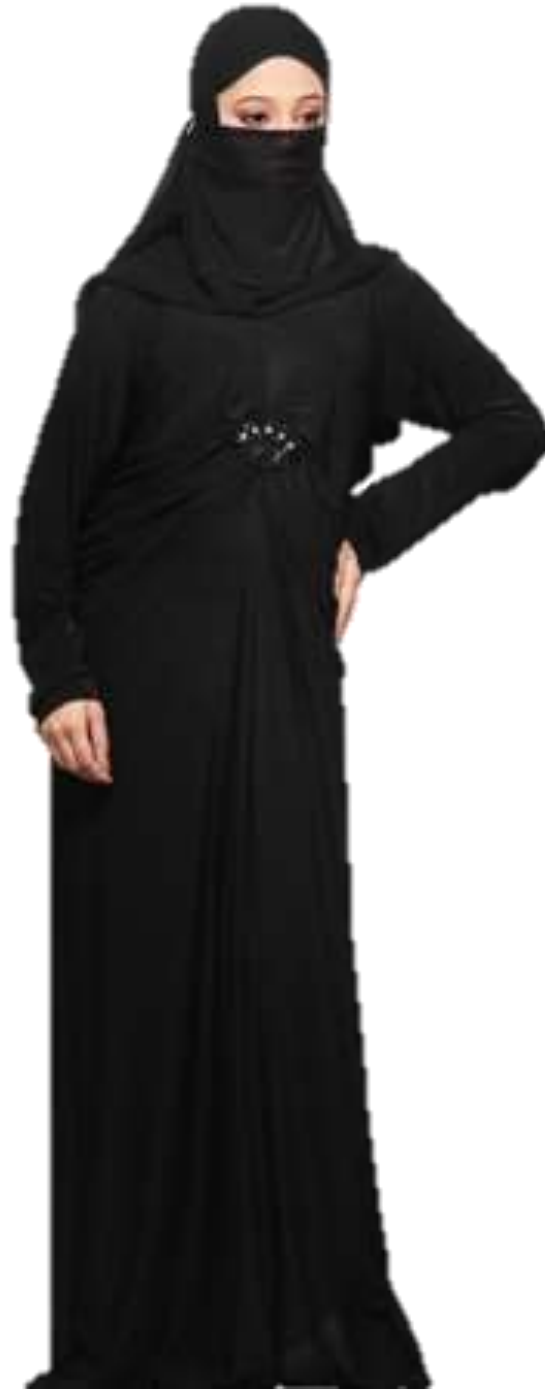
Figure 4. Hijab Style Burqa, Black Lycra readymade burqa, “Embroidered with stone work, it comes along with Lycra mouth cover and faux georgette dupatta,”