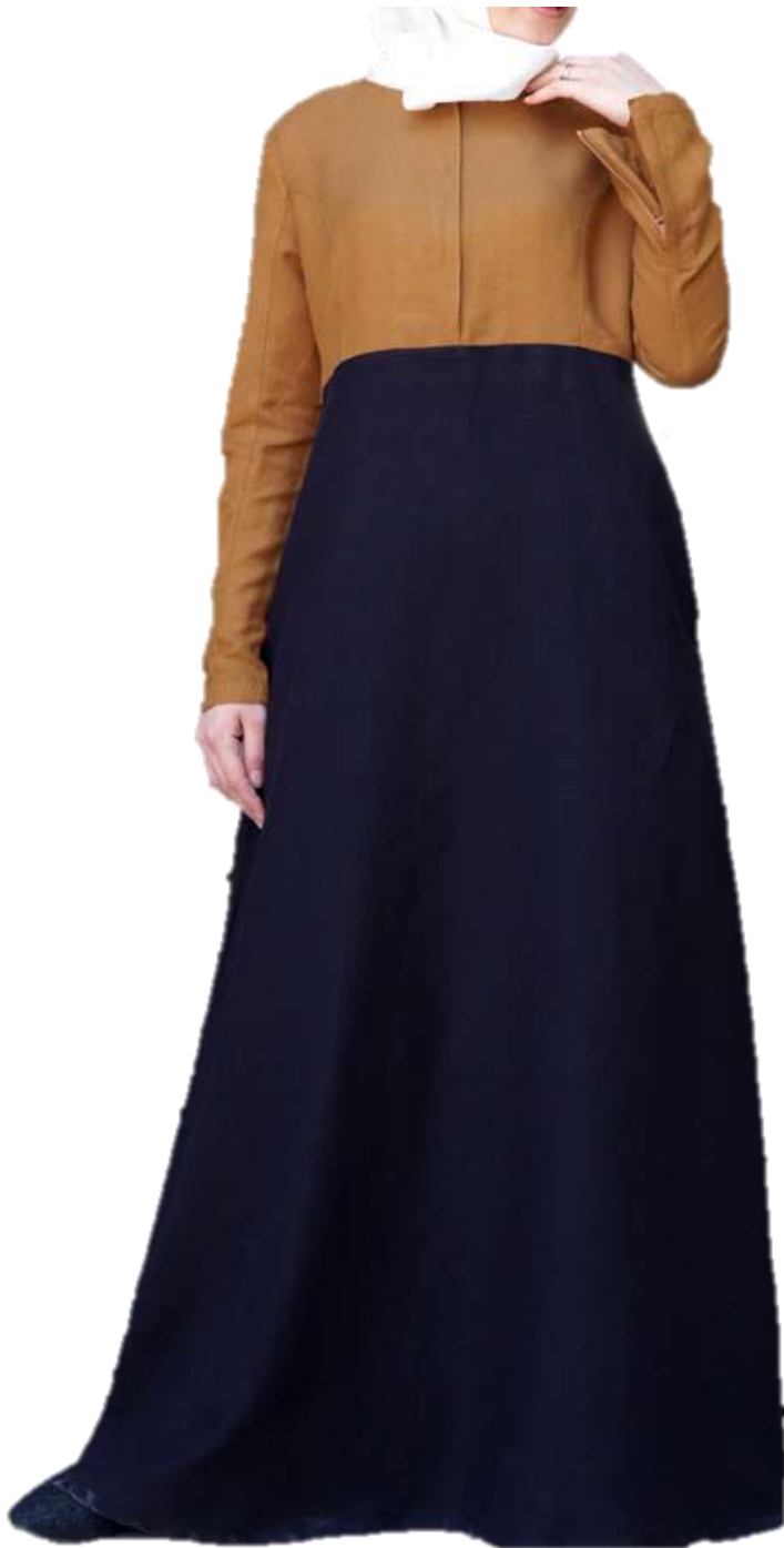
Figure 1. Hijab Style Abaya, Zipped Color Block abaya, “One of our favorites from the new collection, we love everything about this stunning abaya. Simple details and color blocking done right, this long dress boasts contrasting hues in a flattering silhouette perfect for every body type,”