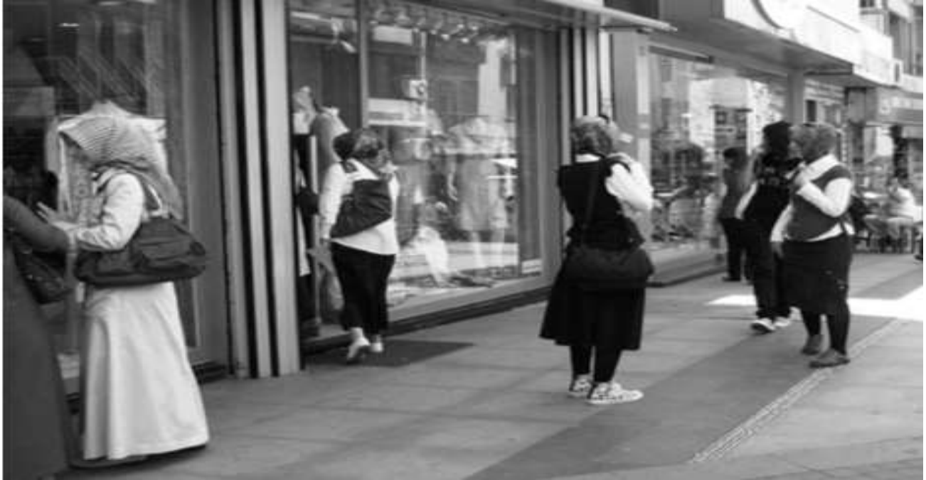
Women window-shopping on Fevzipasa Caddesi, the main commercial street of Faith, Istanbul