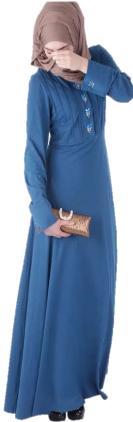
Figure 2. Hijab Style Khimar, Azure Bliss Khimar exquisite abaya, “The ultimate choice for a special day. Flowing styles in hue of teal features pleats on bodice and accentuated with crystal-embellished motifs deliver a sparkling finish. Azure Bliss also features a flattering fit and the shape falls beautifully by flaring at the skirt. Undeniably sophisticated, exquisite and elegant, wear yours with a crepe flower scarf and black or gold crystal clutch,”