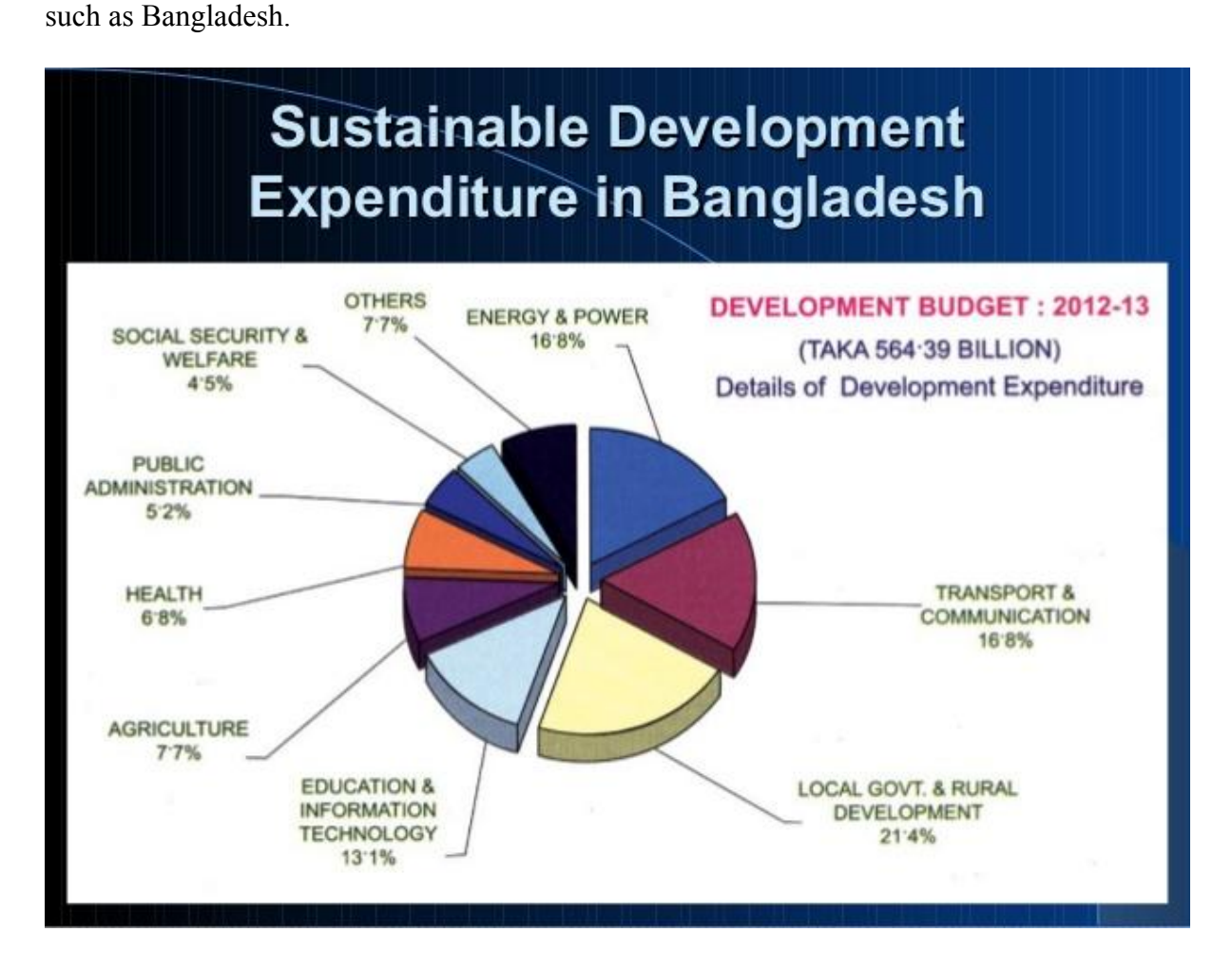
Figure 2. Sustainable development expenditure in Bangladesh

Ideologically, SDGs can be achieved through strategic innovation. The implementation and strategic commitment are to be handled by the governing professionals of the country. Targeted approaches by the governing bodies are to be handled efficiently for improving the discrepancy in the social structure. The development of the national plans needs to be tailored and targeted to overcome the existing barriers and challenges within developing countries