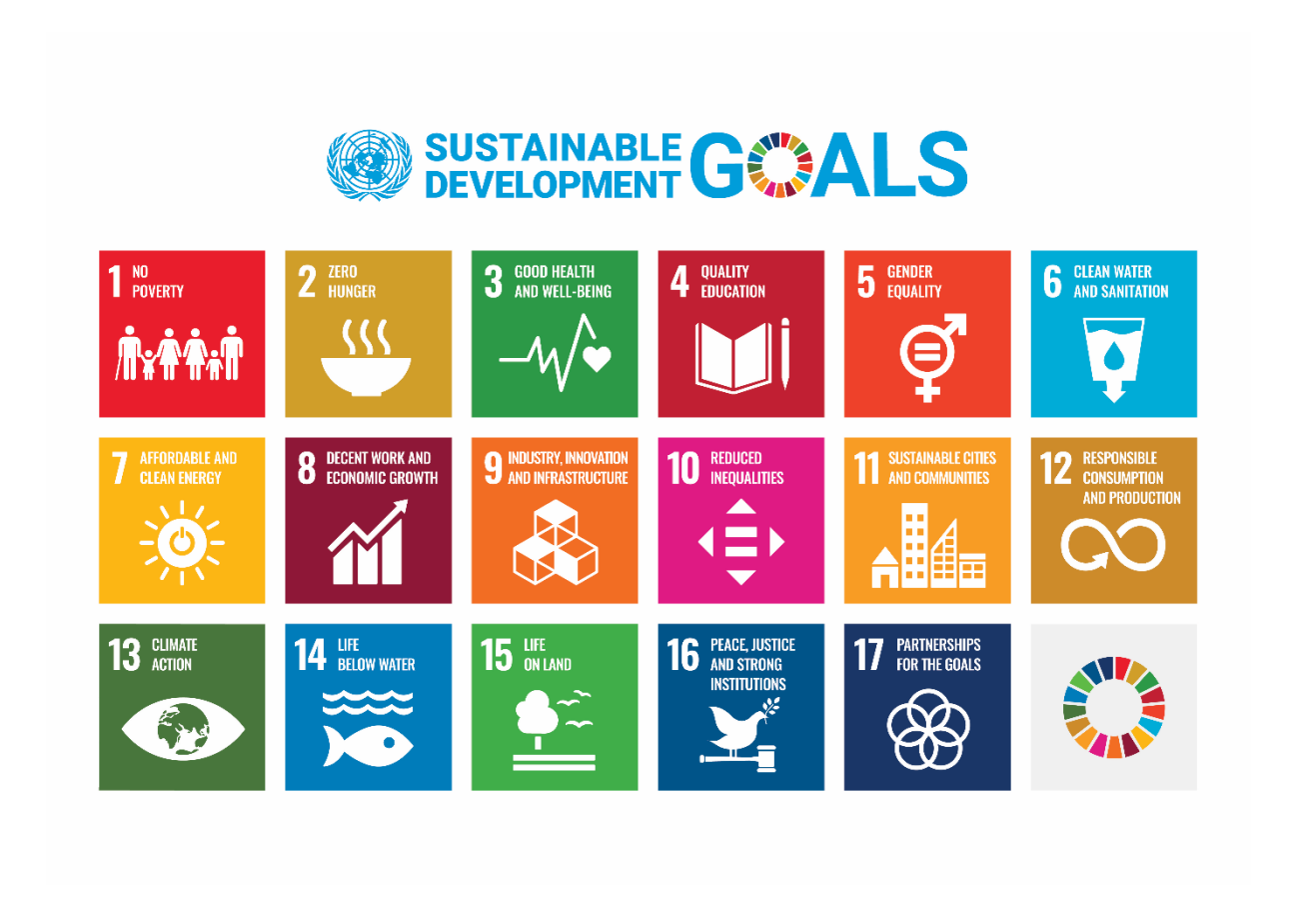
Figure 1: Sustainable Development Goals

All the SDGs listed by the UN are as follows: