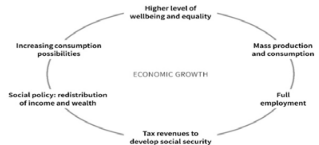
Figure 1: Virtuous Circle Between Economic Growth and Welfare States (Hirvilammi, 2020)

Fiscally, it seems impossible to decouple eco-social welfare states from future growth. The sustainability of welfare capitalism predicates on the virtuous circle set in motion by growth (Figure 1). Higher levels of economic activity stimulate full employment and income, which in turn generate tax revenue for public expenditure. Economic prosperity is hence a necessary precondition for adequate redistribution (Bailey, 2015). Conversely, a non-growing economy curtails investment in decarbonization (to 'green' the welfare state) and social protection for climate risks (to 'socialize' the environmental state) (Mandelli, 2022). This is evidenced by the global collapse of tax revenue during the 2008 Great Recession, which triggered austerity measures and benefit cuts.