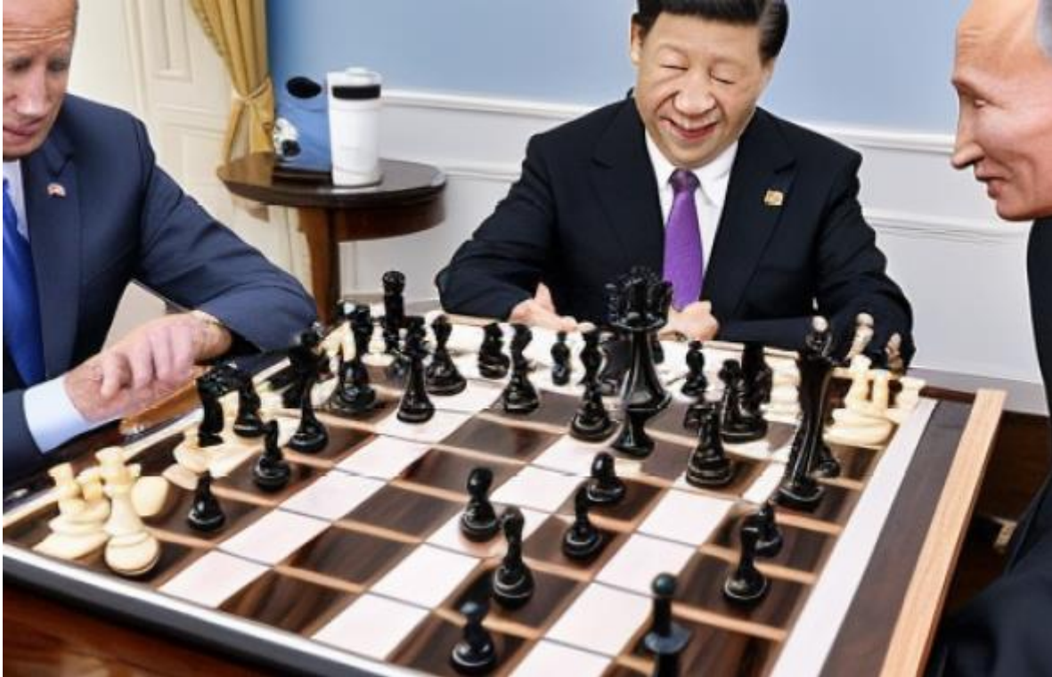
An AI image created by the stability.ai website, depicting a chess match between Putin and Biden with Xi as an observer.

Will 2023 be the year of great convergence? a year in which seemingly unrelated regional conflicts become interconnected as a single event that resembles or begins to resemble a global war? This article will attempt to examine the developments in the geopolitical arena and draw from them the future possibilities.