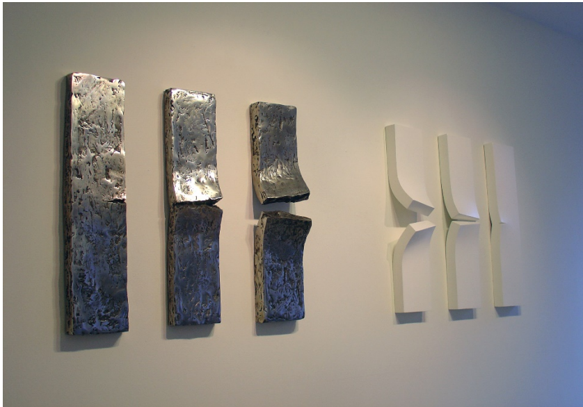
Sustainable future - Quo vadis